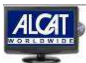
IN Office DVD